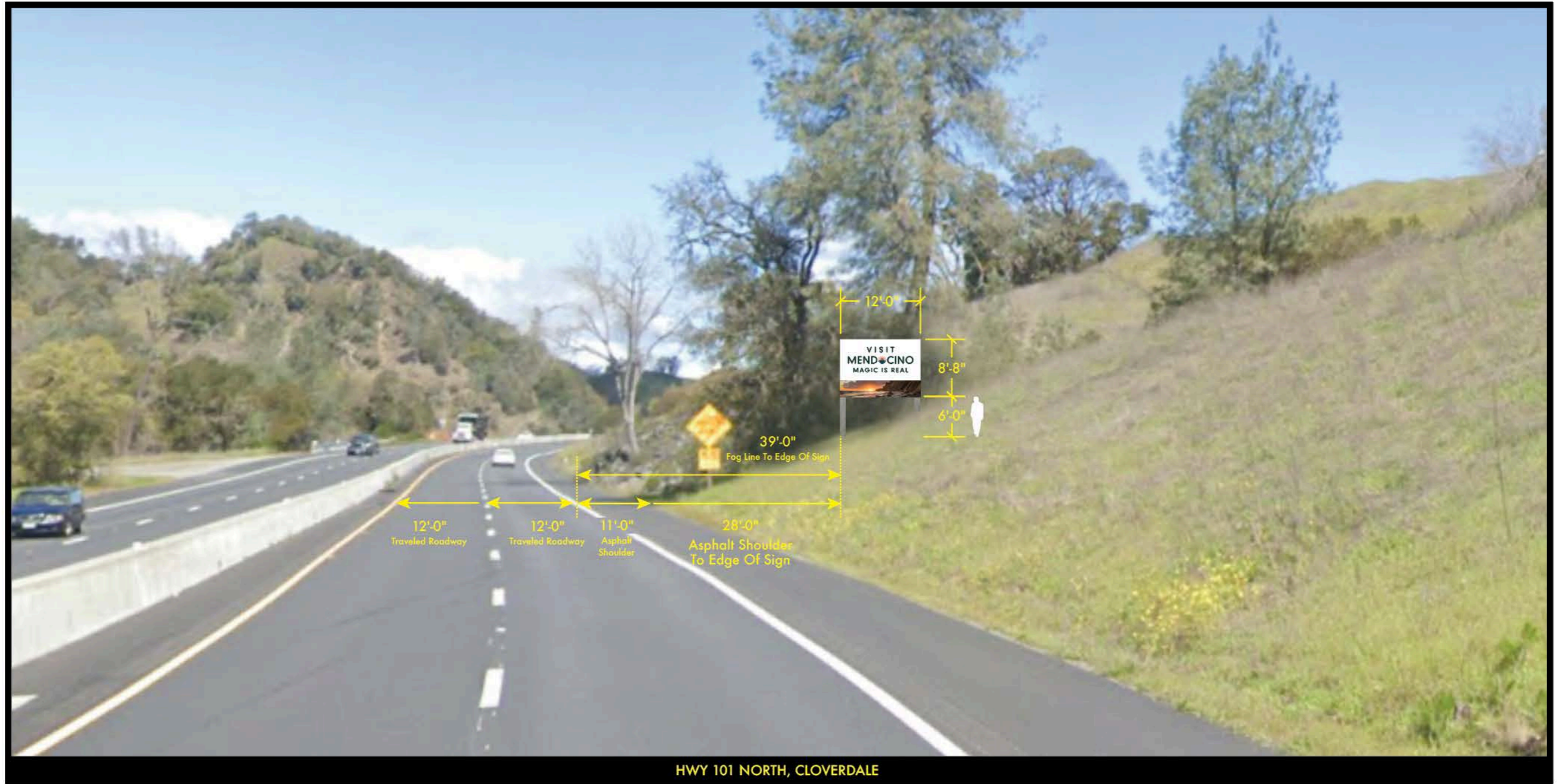
HWY 101 NORTH, CLOVERDALE