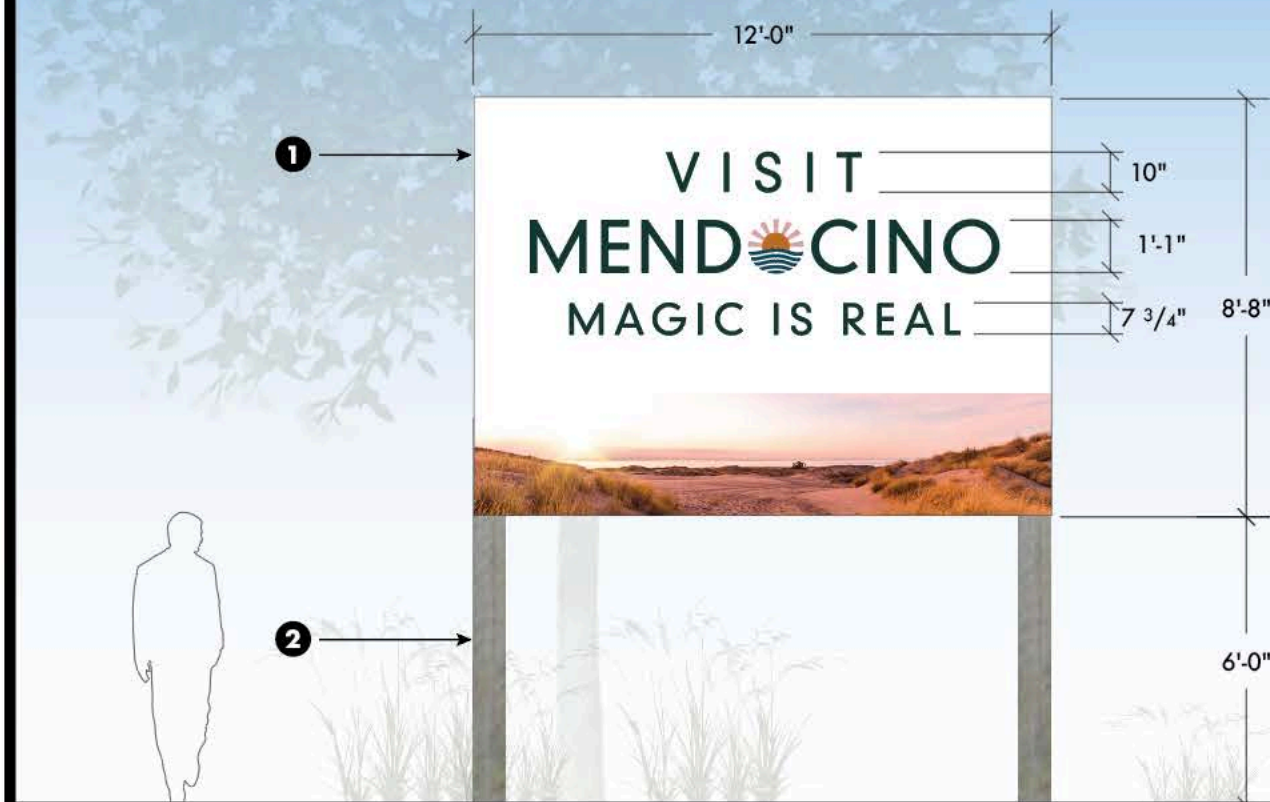
FRONT VIEW - HWY 101 NORTH, CLOVERDALE

NOTE: Dashed lines indicate seams in face after printing to 4'x8' .080 aluminum.