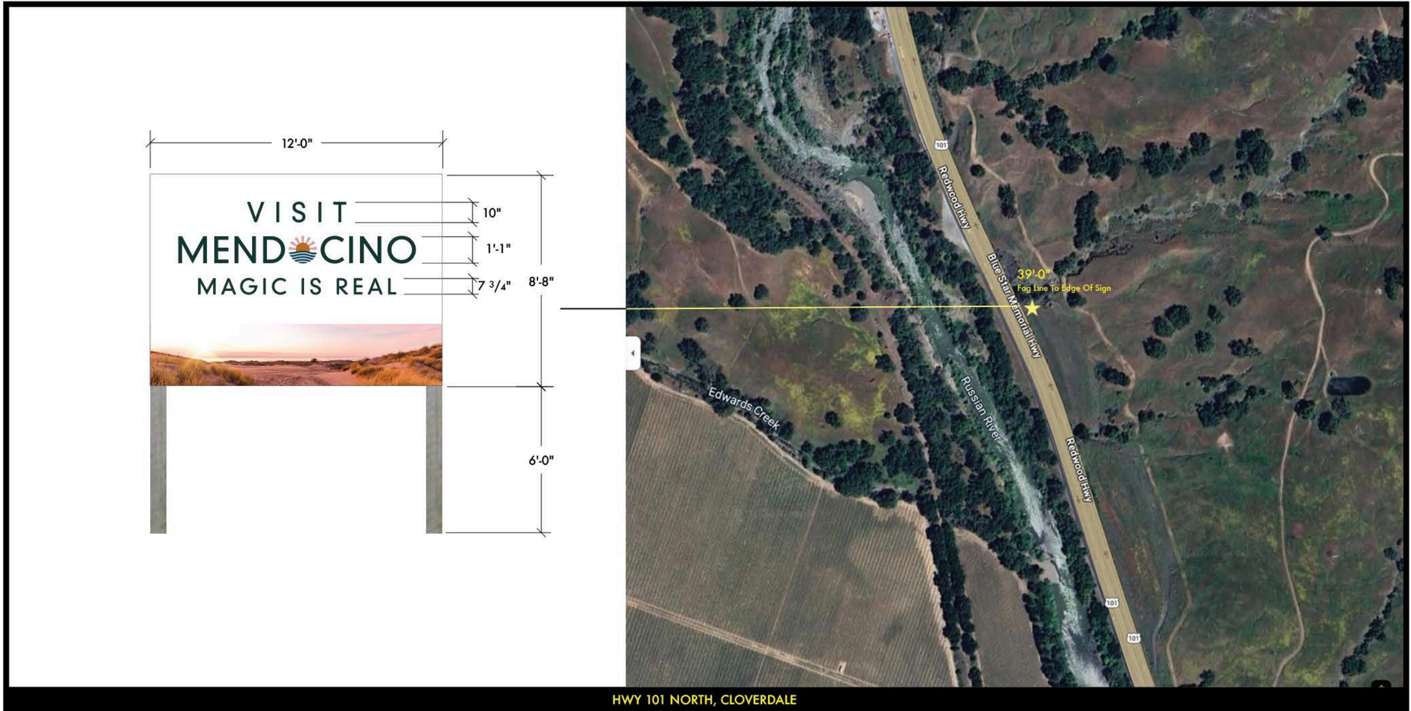
HWY 101 NORTH, CLOVERDALE