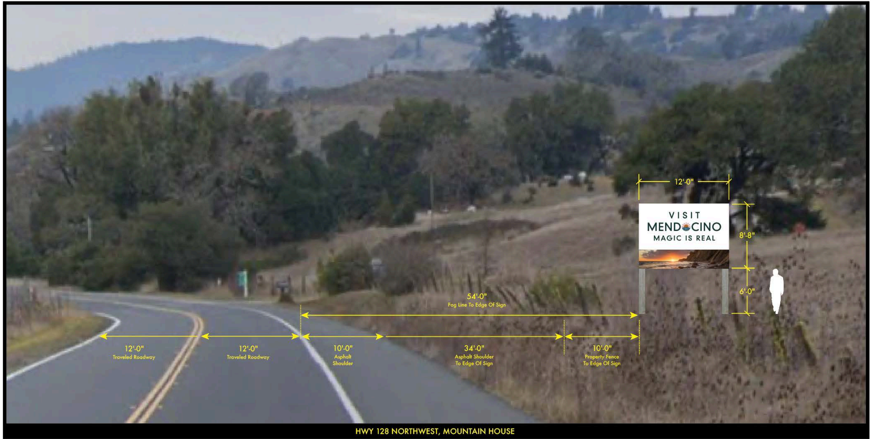
HWY 128 NORTHWEST, MOUNTAIN HOUSE